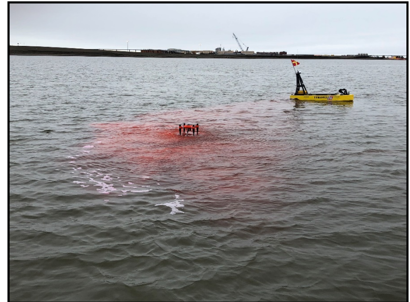
Unmanned surface vehicle (“Minion”) with Splash Drone on top